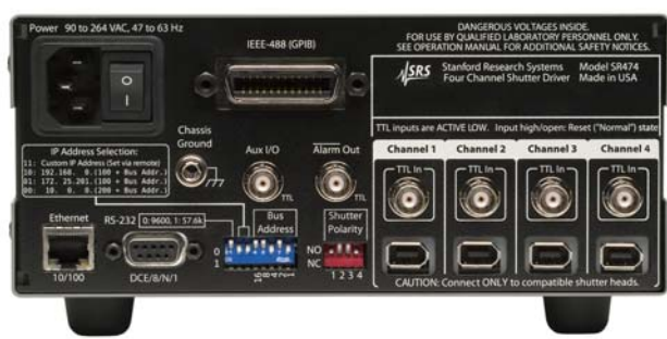
SR474 Rear Panel