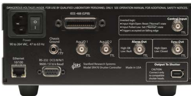
SR470 Rear Panel

The SR470 and SR474 Laser Shutter systems from SRS offer performance and reliability not found in other systems. For more details call us at 408-744-9040.