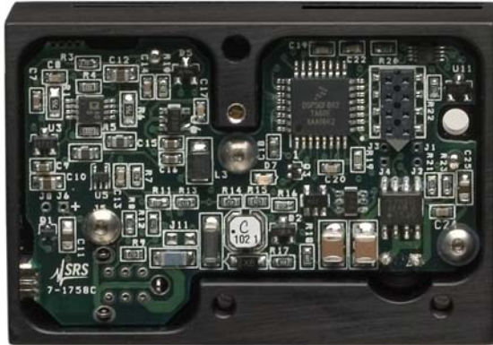
SR475 Shutter Head with cover removed, revealing control system electronics

The 3 mm clear aperture is designed for easy alignment and is large enough to be used with common light sources. Typical rise and fall times are under 500 \mu s, and repetition rates from DC to 125 Hz can be used. Unlike other shutters, the SRS shutter is not duty cycle limited — you can run any duty cycle you choose.